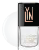
LYN TOP COAT