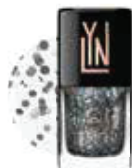
A THING FOR BLING