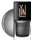
STEEL-ING THE SHOW