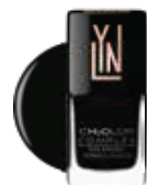
BRINGING SEXY BLACK