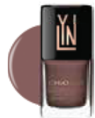
BEACH YOU TO IT