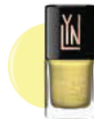
BUTTER ME UP!