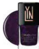
MIDNIGHT IN PARIS