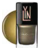
BRR, IT'S GOLD IN HERE