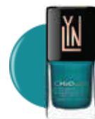
TEAL ME MORE