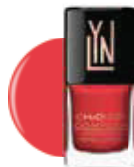
ORANGE YOU PRETTY?