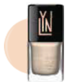
PICKING PRETTY PINK