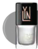
SNOW ME A GOOD TIME