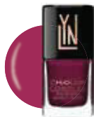
WE'RE GRAPE TOGETHER