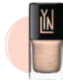
BARE AS A BABY