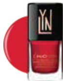
YOU RED MY THOUGHTS