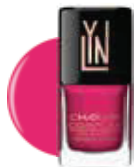
ORCHID BE WITH YOU FOREVER