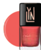
CORAL ME HABIBI