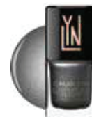
CHROME OVER TO MY PLACE