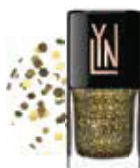
I SPOT GOLD!