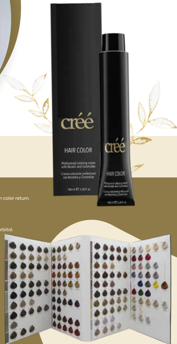
CHART WITH 160 COLOR OPTIONS.